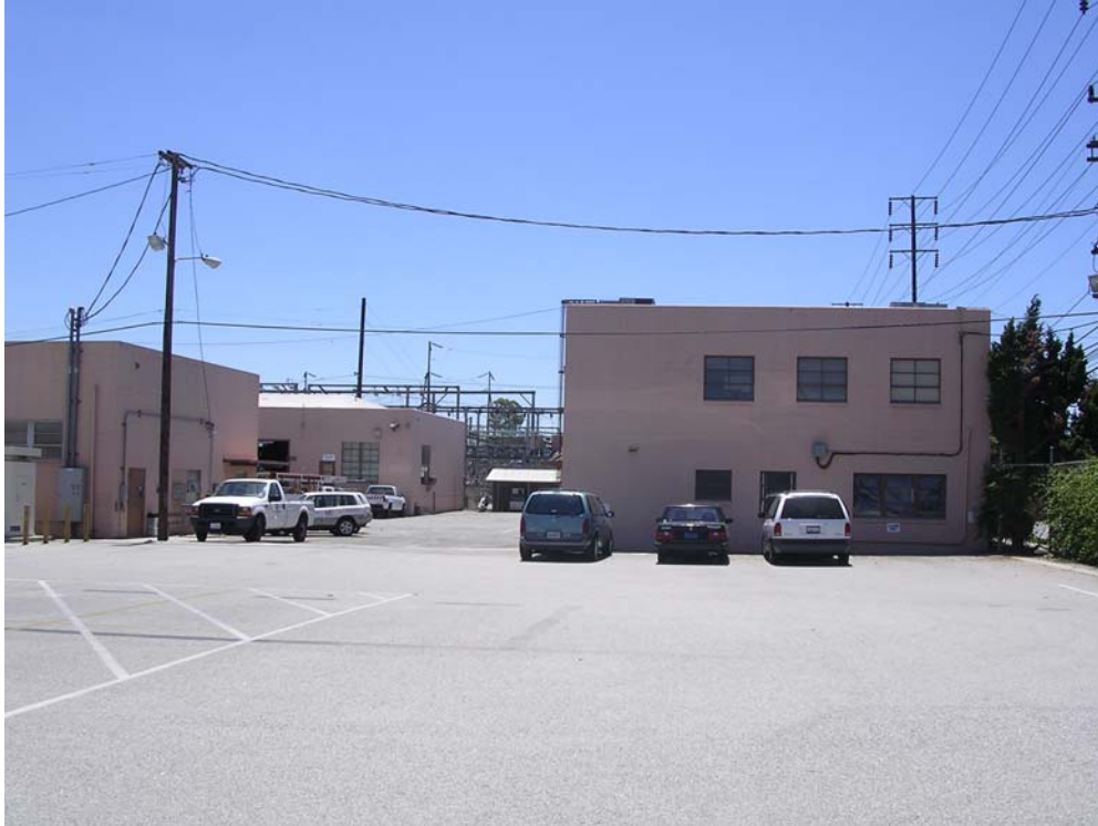
Figure 5: View of the current West Los Angeles District Headquarters Administration Building (facing southwest). The new two-story building would be situated in the foreground, directly northeast from this building.