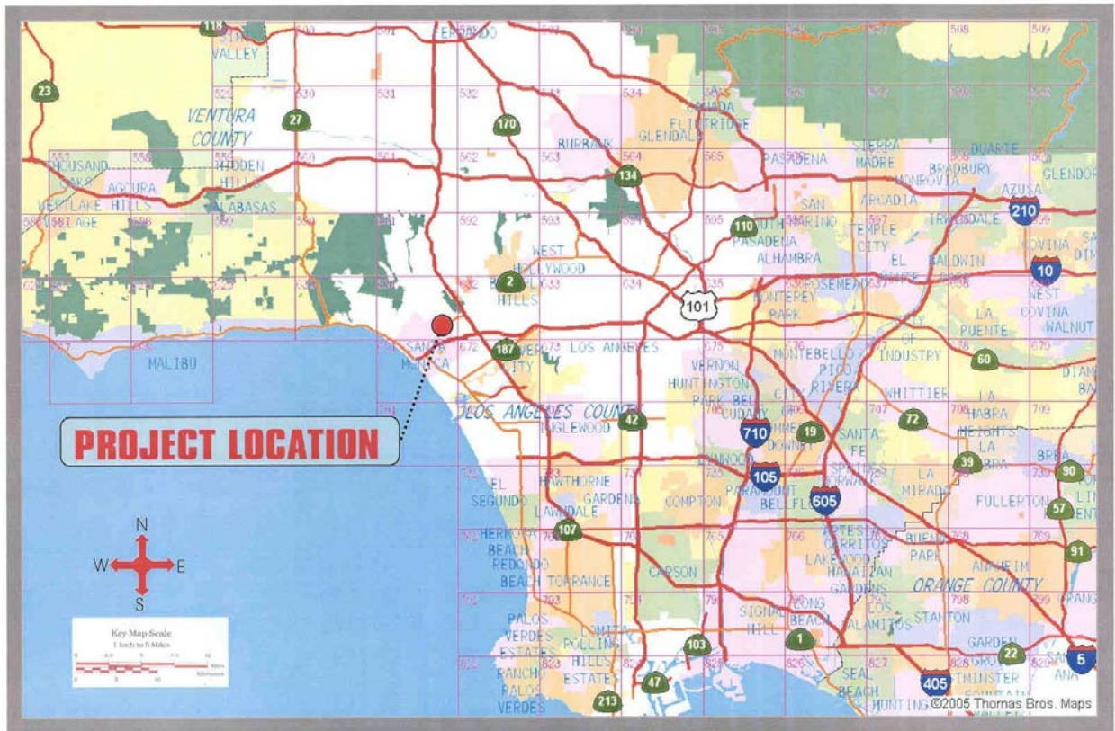
FIGURE 2 : REGIONAL LOCATION MAP