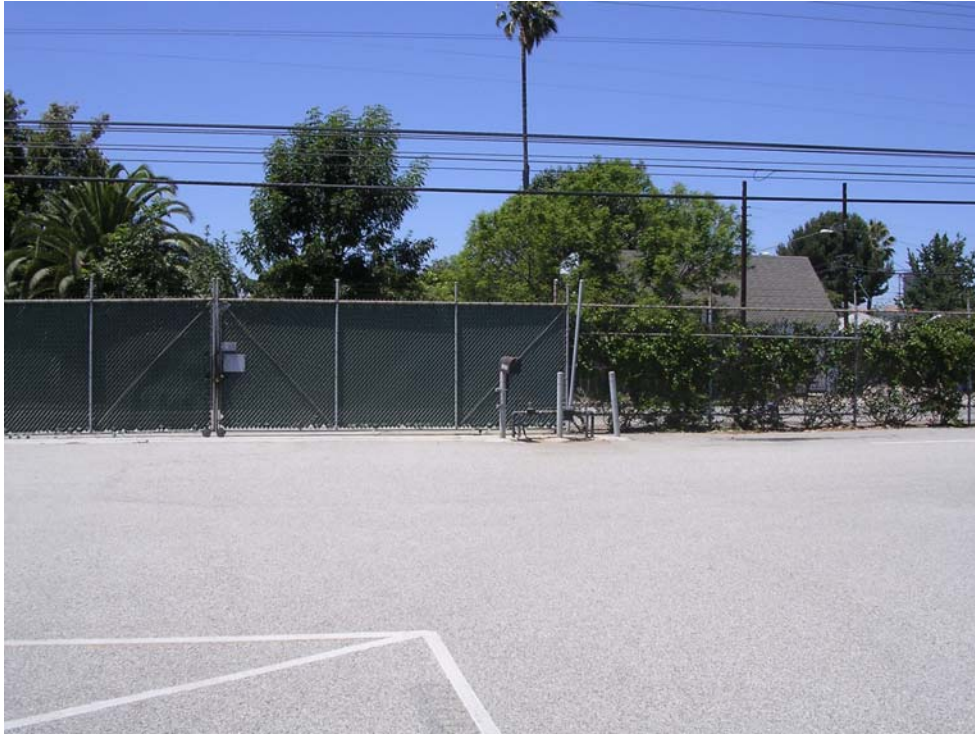
Figure 4: View of the current parking area (facing northwest) at the West Los Angeles District Headquarters showing a portion of the parking area where the new proposed office building will be located.

the visual character of the surrounding area would be less than significant, and no mitigation is necessary (see Figures 4 and 5). Furthermore, the design will be submitted for review and approval by the City of Los Angeles Cultural Affairs Commission.