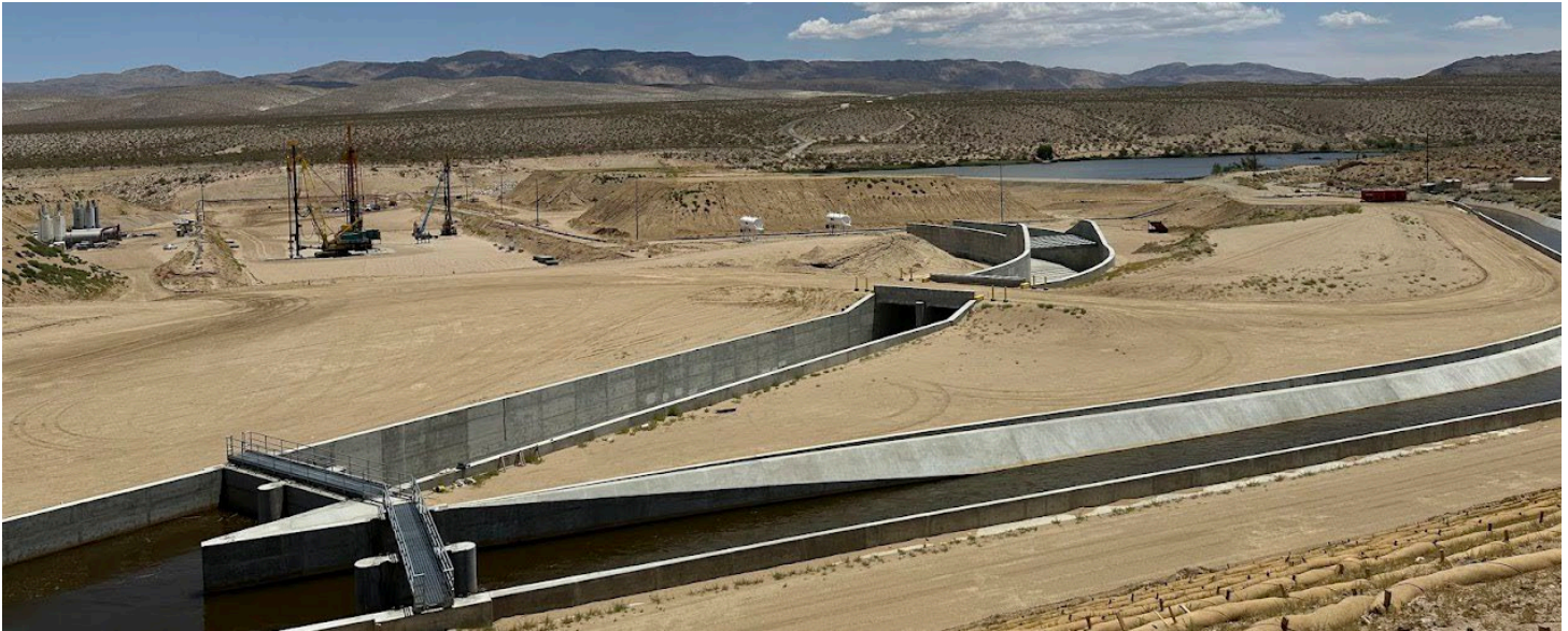
Los Angeles Aqueduct Realignment