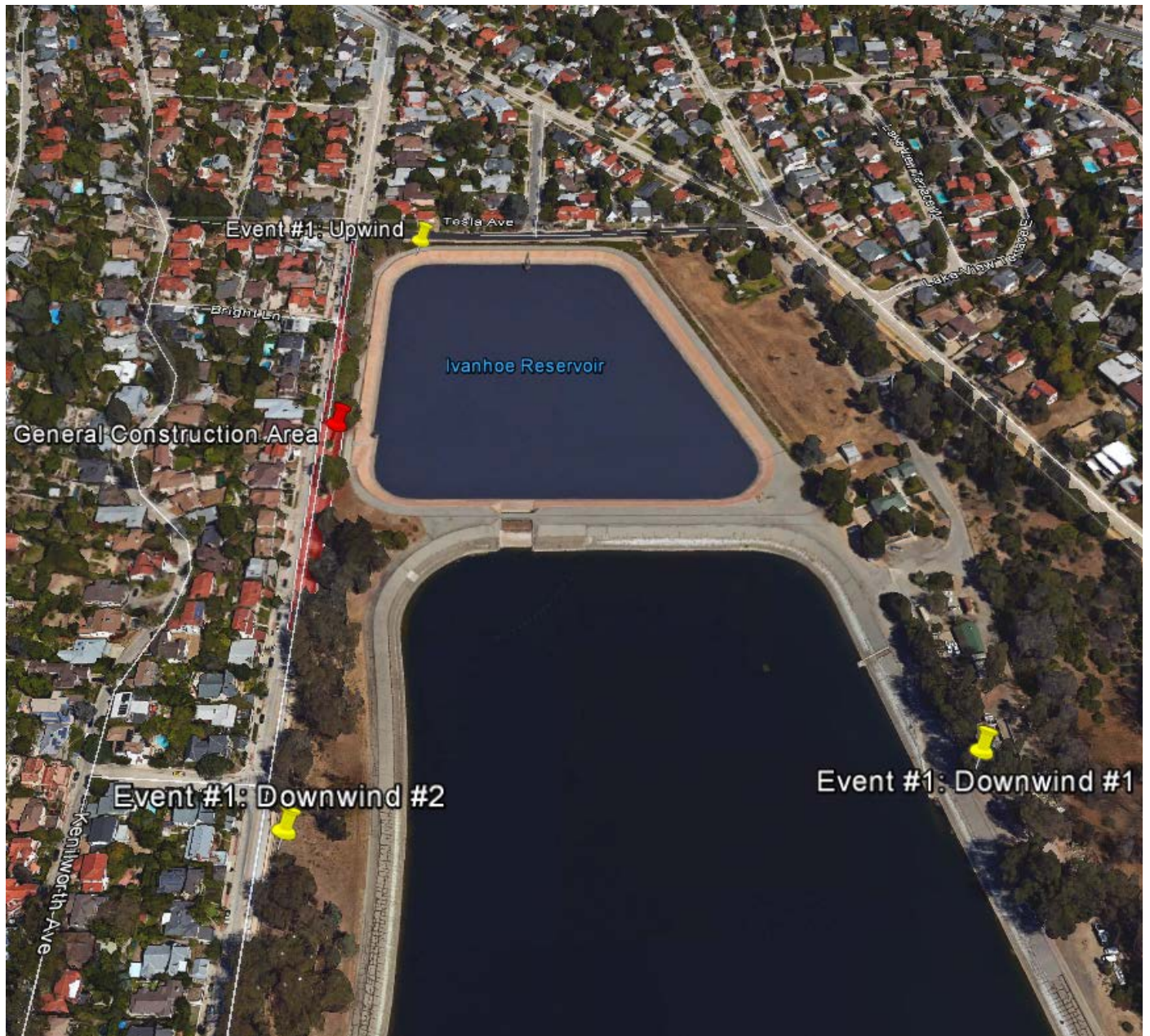
FIGURE 1-1: FIELD SAMPLING LOCATIONS